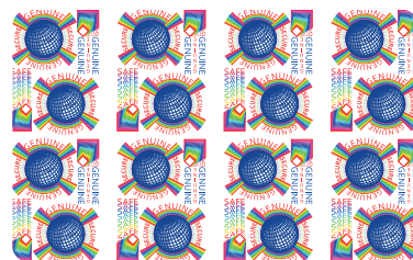
Evolis Genuine Globes Design